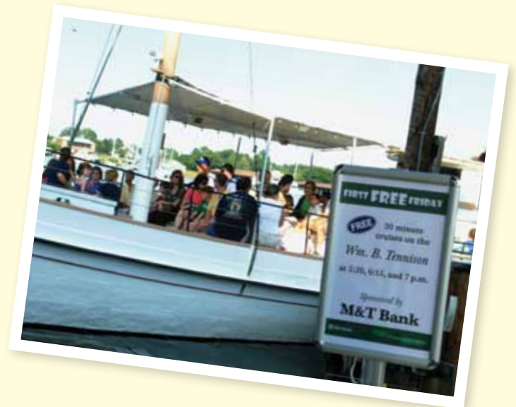
A free cruise on the Wm. B. Tennison during the First Free Friday in August, sponsored by M&T Bank.