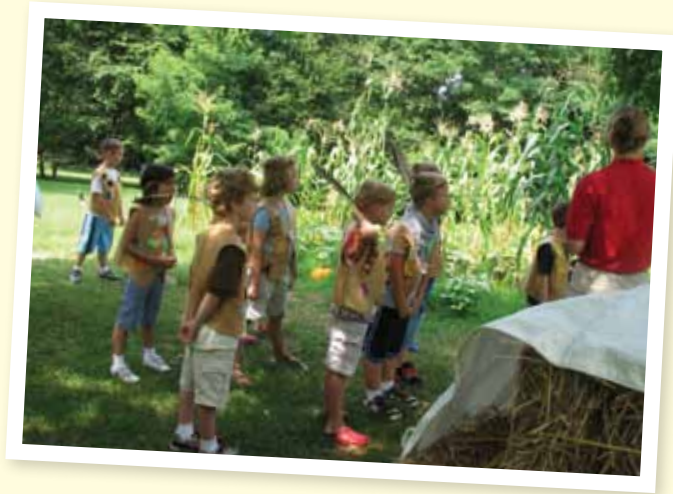
The Chesapeake Indian campers visit the Native Village at Jefferson Patterson Park and Museum.