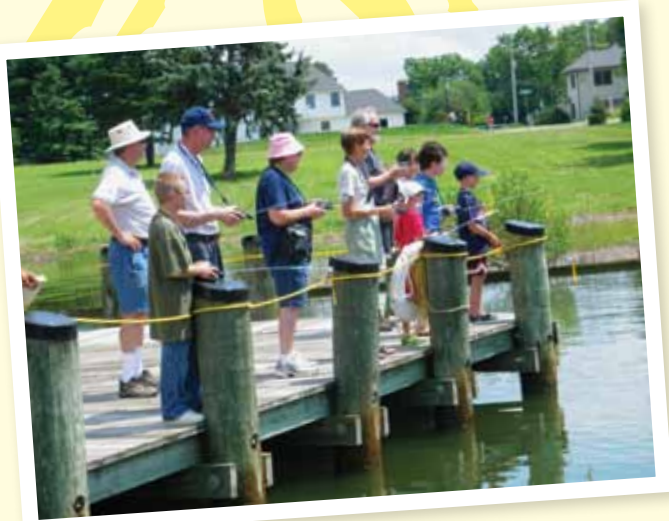
An intergenerational group operates radio-controller boats off the CMM pier.

Four summer camps and three Intergenerational Elderhostel Programs during the summer kept the education department staff and volunteers extremely busy. The season began on June 22 with the first of three Elderhostel programs, followed by two more in July, all with the theme of "Fossils, Fins, & Fun," and attended by sixty grandparents and grandchildren. The four camps for various ages began on July 13 with the "Shark Attack Camp," followed by the "Brownie Summer Camp" and the "Cardboard Boat Camp" on July 20, and ending with the "Chesapeake Indian Summer Camp" on July 27. The following are selected scenes from these various educational activities of the museum. 🚤