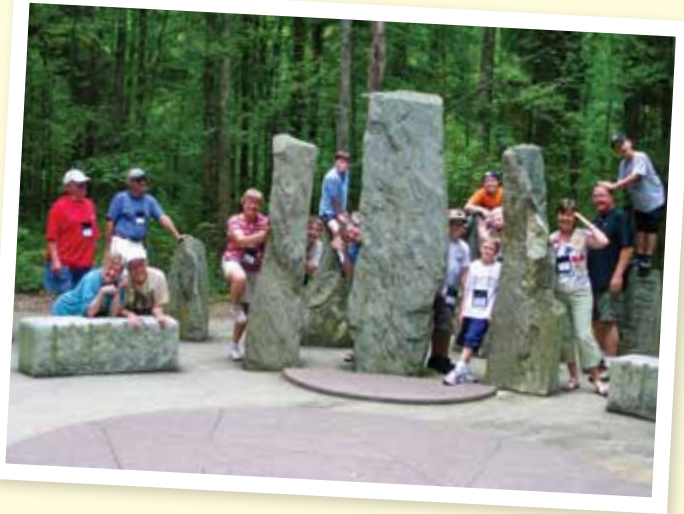
A second intergenerational Elderhostel group assembles at Annmarie Garden for a group photo.