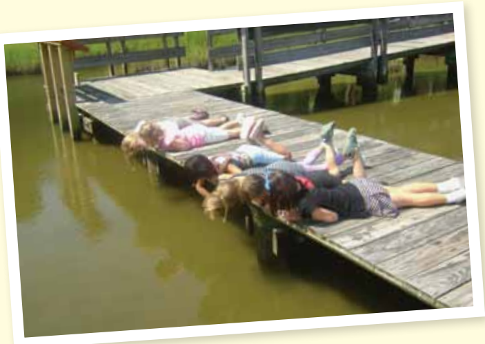
Brownies study life in the CMM marsh.