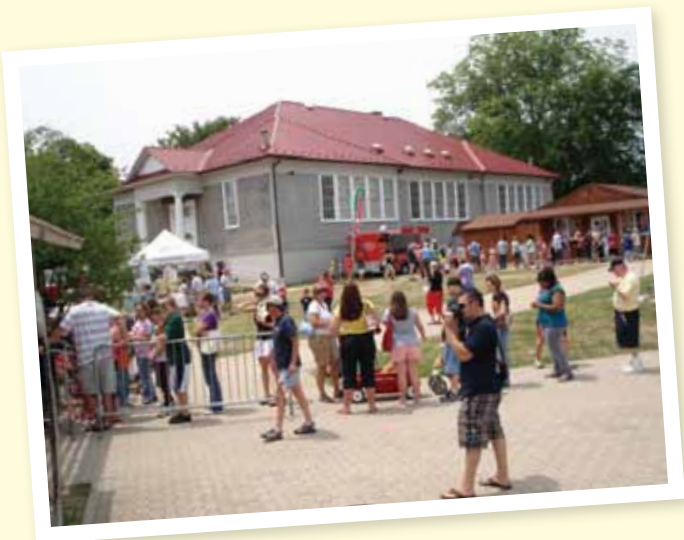
The lineup of people attending the ever-popular Sharkfest! on July 11.