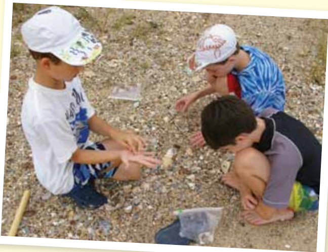
"Shark Attack" campers search for sharks' teeth.