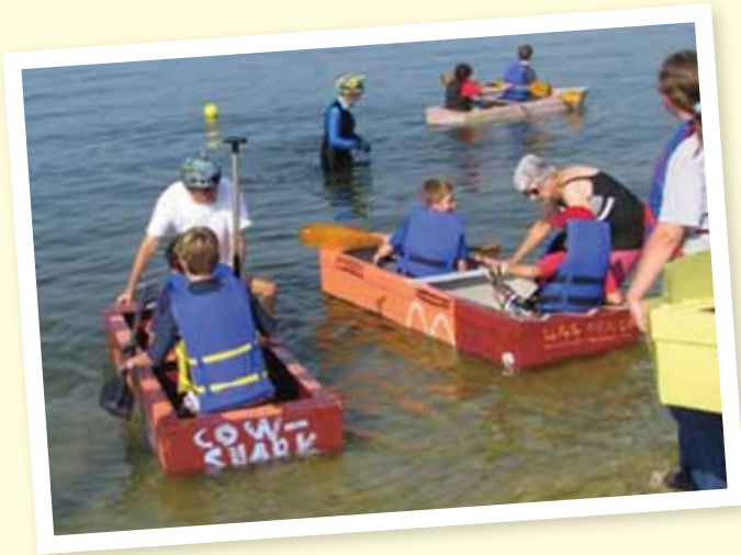
Campers prepare for a cardboard boat regatta. CMM education department photo