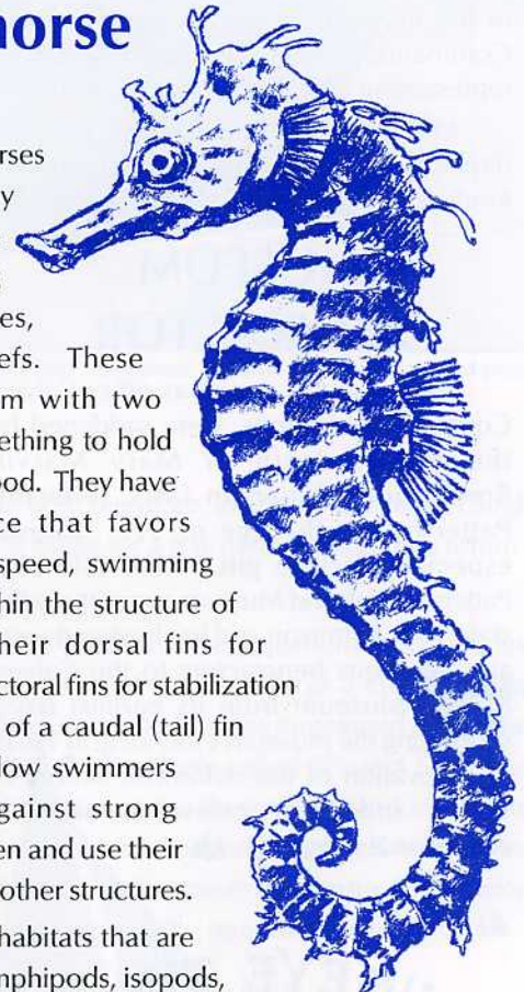
Drawings by Tim Sheirer.

By contrast, seahorses have few natural predators, since their hard bony structure makes them rather unpalatable, although such large pelagic fish as tuna eat the species that live in sargassum weed. Young seahorses, however, are devoured by many species of fish, and rely on the refuge afforded by the structure (shells,